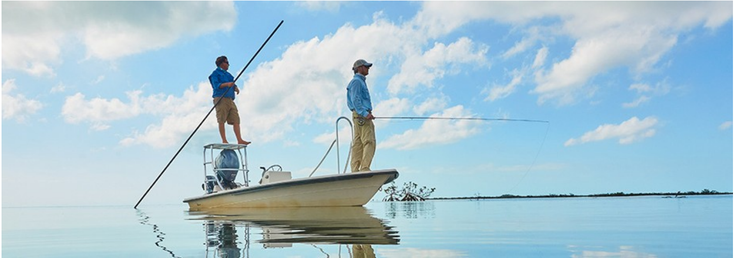
A fly fisherman and professional fishing guide look for bonefish.

DNA testing allows researchers to piece together how populations of bonefish in one area support those in other areas. Without it, researchers can only get a sense of population connectivity by studying the speeds and trajectories of ocean currents.