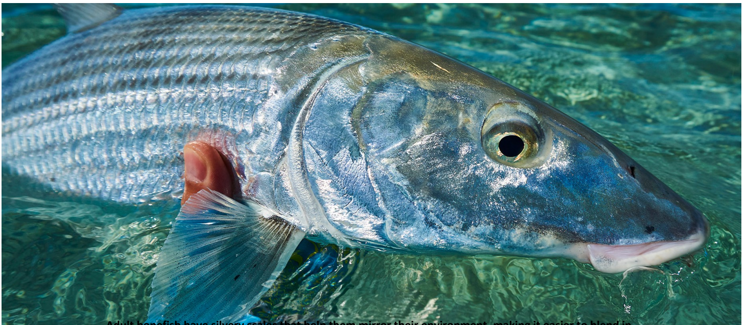
Adult bonefish have silvery scales that help them mirror their environment, making it easier to blend in.

Mature bonefish spawn offshore in the open ocean. Large schools called spawning aggregations leave the shallows for the open ocean and then release their eggs and sperm simultaneously into the water where the eggs are fertilized. This is a reproductive strategy called broadcast spawning , and it has many advantages. First, the large number of participating males and females encourages genetic diversity. Second, ocean currents may carry the offspring to multiple settling areas – typically shallow mud- or sand- bottomed habitats within lagoons and bays that offer shelter and food. Larval bonefish spend 42 to 72 days floating on ocean currents. One spawning aggregation of bonefish may be responsible for repopulating the fisheries in multiple places at various distances.