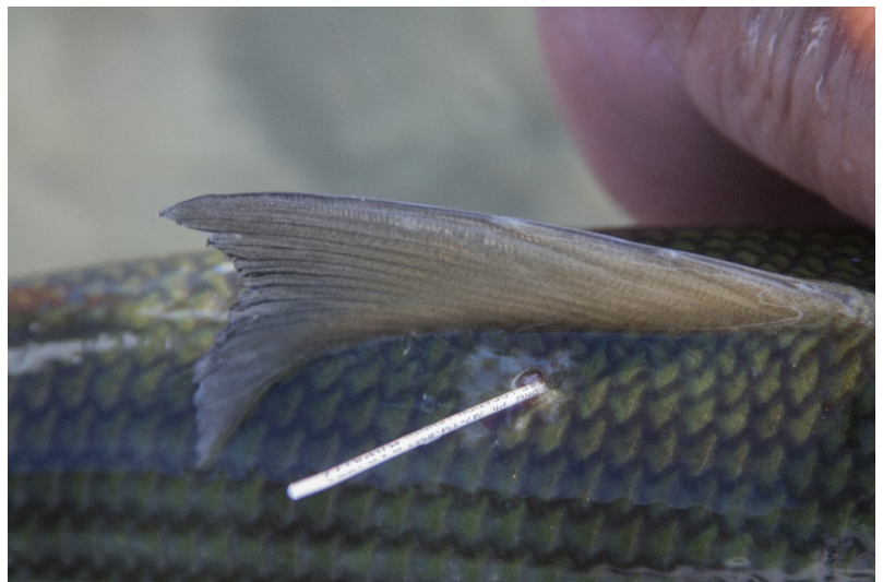
Spaghetti tags are used for catch-and-release studies, where fishermen who catch the fish again will call the number listed on the tag and report information about where the fish was caught and how big is it. You can see where the name comes from!

The first type of tag that researchers and fishermen used for this study was a spaghetti tag. Spaghetti tags are attached just under the skin of the fish next to the dorsal fin. These tags have unique numbers, and contact information of the researcher printed on them so that if/when the fish is recaptured, scientists can learn where it was caught.