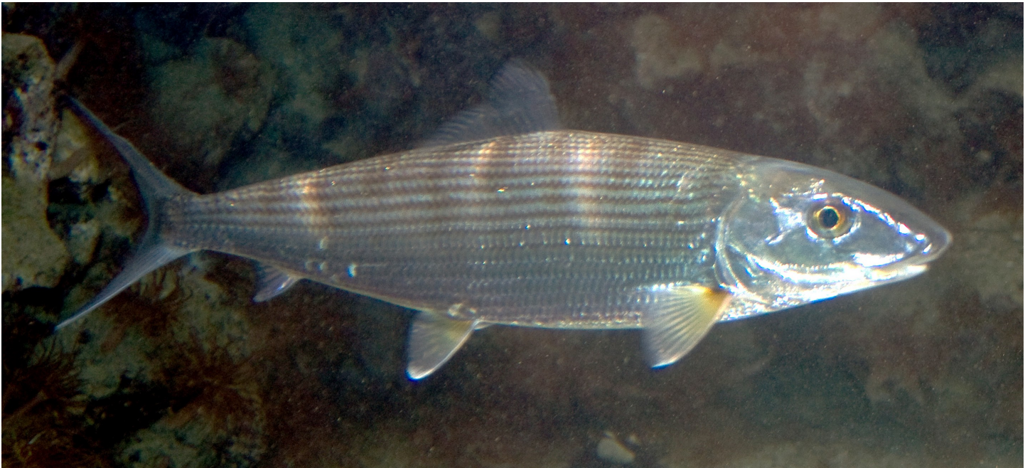
The most popular bonefish species in Florida and around the Caribbean is Albula vulpes , known as “the white fox.”

Globally, scientists have identified twelve species of bonefish. Though subtle physical differences can distinguish the species, genetic information provides evidence of different species, as well as indications of kinship between sub-populations of the same species.